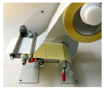
Label Threading Path

OPTIONAL LABEL COUNTER: The optional Label Counter will add one count to the displayed number for each label that is dispensed. This Option is available only factory installed in new units.